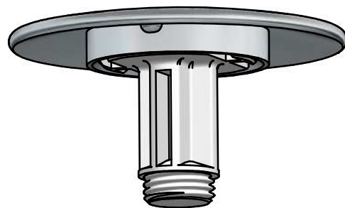
SCREWED PLASTIC INSERT ON CAP (THE USUAL OF THE NEW P710 \phi 63 ).